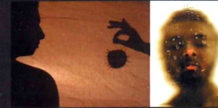
Mohamed Safar / VISUAL ARTS / photography

the effect of the media and the internet in our life, the project will be sort of photography and painting installation, their will be a painted and real object attached on the wall and the floor, so I will need a small cubed room or corner about 3x3m or 2x3 or what's available lolii_j@hotmail.com