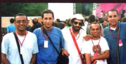
Massar Egbail / MUSIC / Rock

My project is to make stenope photographs. It's an equation: position of the box, light also controlling the developing process to get a complete successful image. Exhibiting my work depends on repeating the same image in different directions with only a monochrome photo assembling an imaginary moment during the several long seconds of filming. dahilarefaat@gmail.com