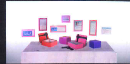
Lamia Moghazy / VISUAL ARTS / Installation

My work is instillation painting photography and sculptour some light and music taking about delirant-- faces and human been. r_nawar@hotmail.com